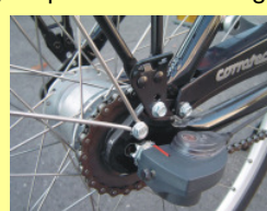
Type C (both photos) Hub-gear with klik-box (for exp. Sram) or gear rod through the axle