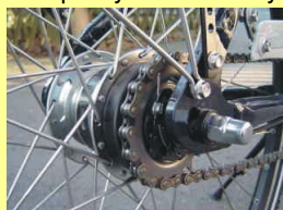
Type B Chain- or hub-gear with a solid axle with wheel nuts M10x1 or 3/8, Shimano